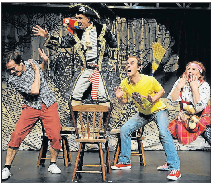
COMING SOON: 26-Storey Treehouse will visit Port Lincoln next month.

This original stage adaptation of the 26-Storey Treehouse follows a highly successful stage production of The 13-Storey